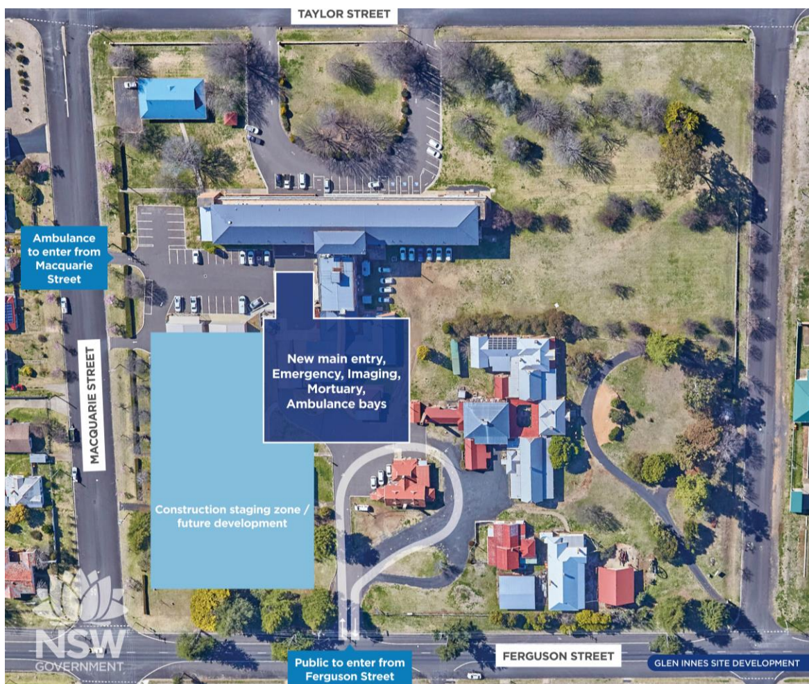
Image: Updated site plan for the Glen Innes Hospital Redevelopment

The design process explored many options for delivering the aims of the redevelopment and includes future expansion zones to allow a staged approach to deliver the full master plan. This stage of the redevelopment will improve flows throughout the hospital for patients and staff. The demolition of the old nurses building that was completed in late 2023 will allow for a construction staging zone and support the delivery of the full master plan in the future. The Spanish Flu Building will be retained in this stage of the redevelopment and access for the neighbouring Museum will remain from Ferguson Street.