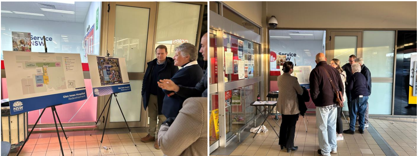
Images above: Community pop-ups held on 24 and 25 July 2024 at Mackenzie Mall