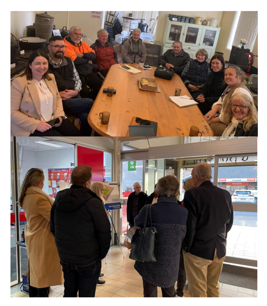
Images: the project team engaging with members from the Historical Society and community members in Glen Innes in June 2022.