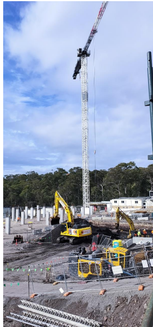
Photograph 3 – ASB looking East