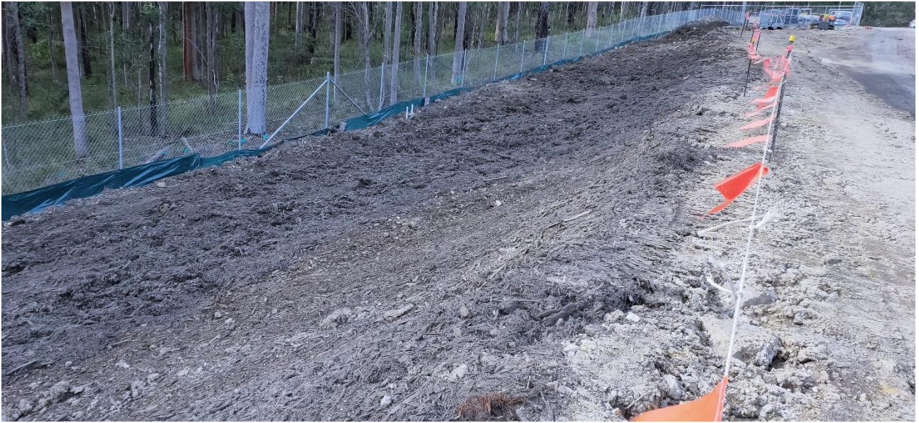
Photograph 7 – Batter slope treatment east west access road 2