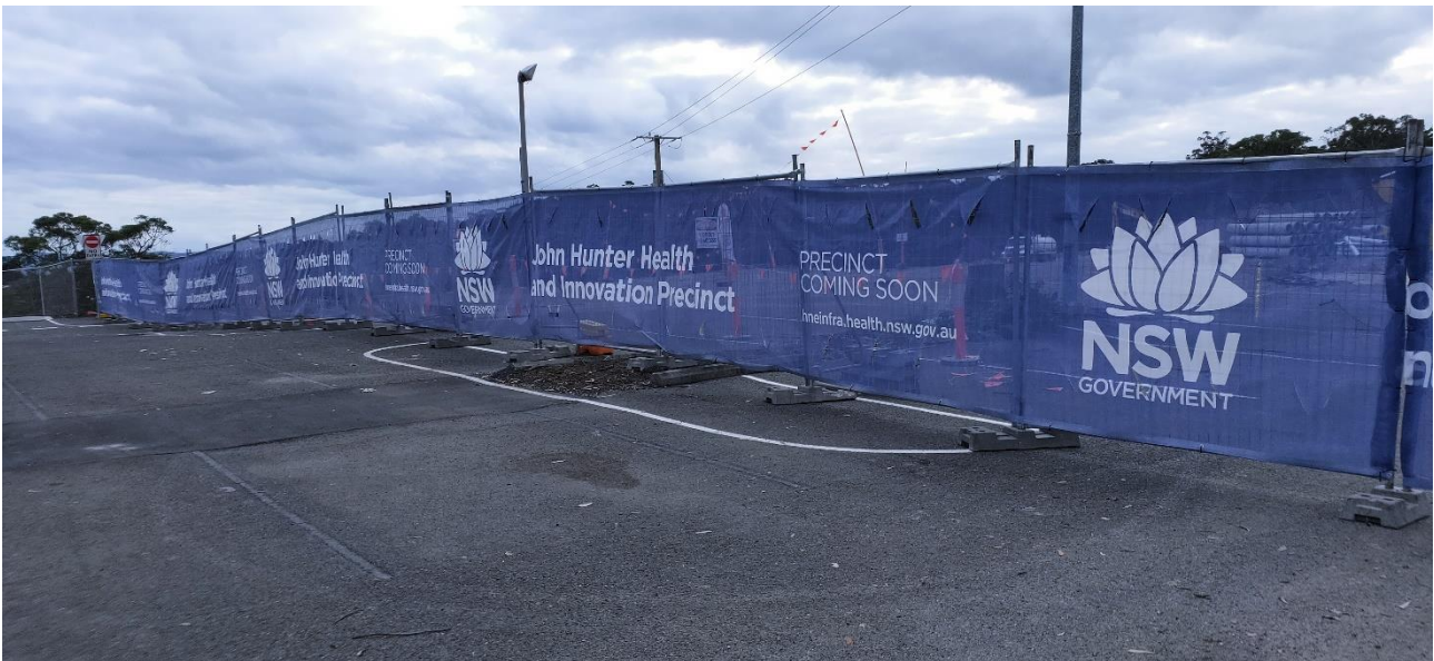
Photograph 10 – Fence wrapping JHH carpark