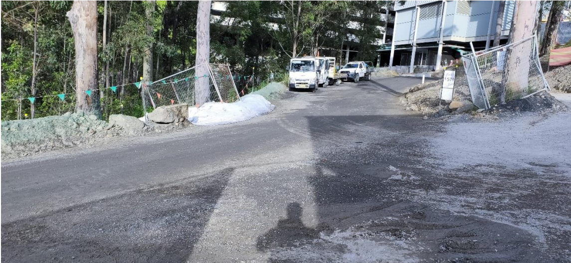
Photograph 4 – Temporary access road sealed