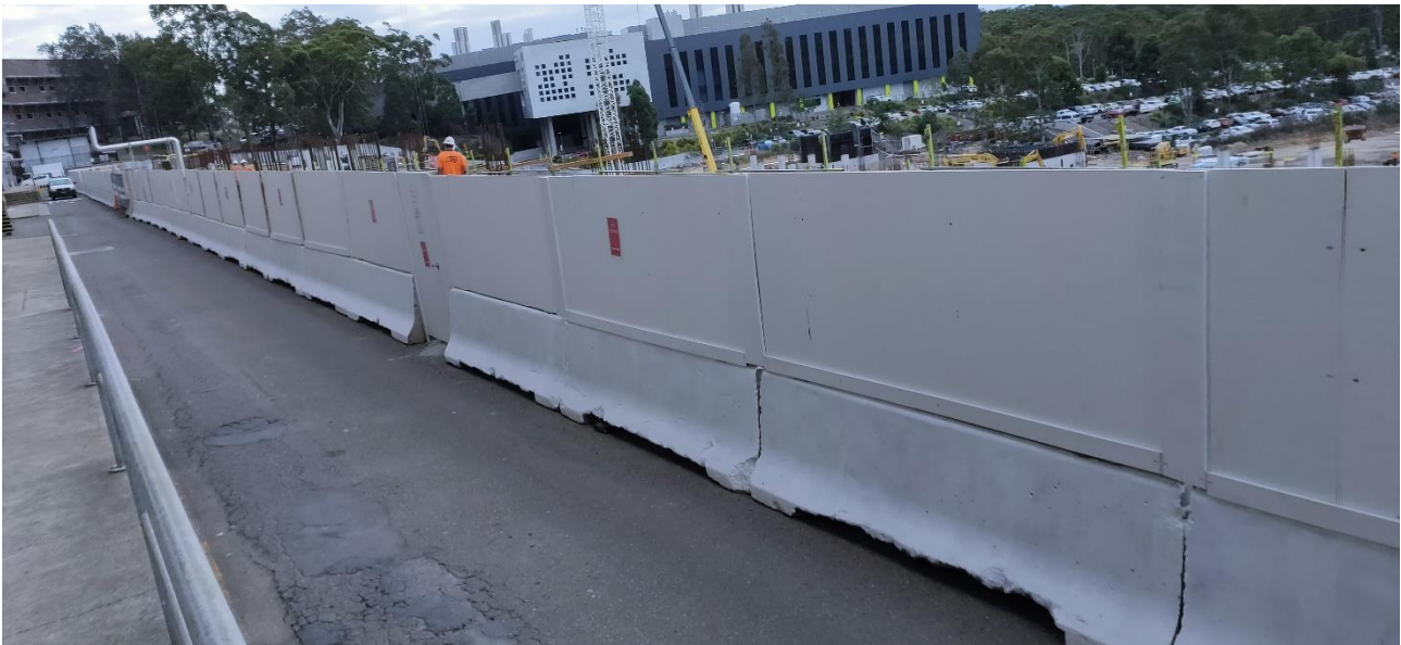
Photograph 9 – Hoarding on Kookaburra Circuit