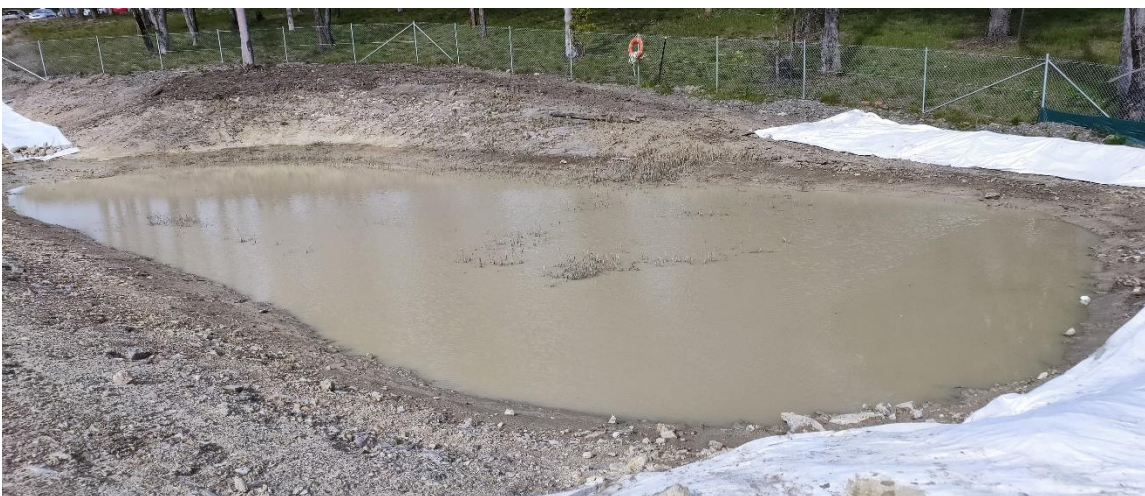
Photograph 6 – Basin on east-west access road