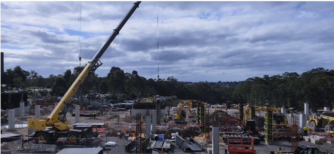
Photograph 5 – ABS looking North