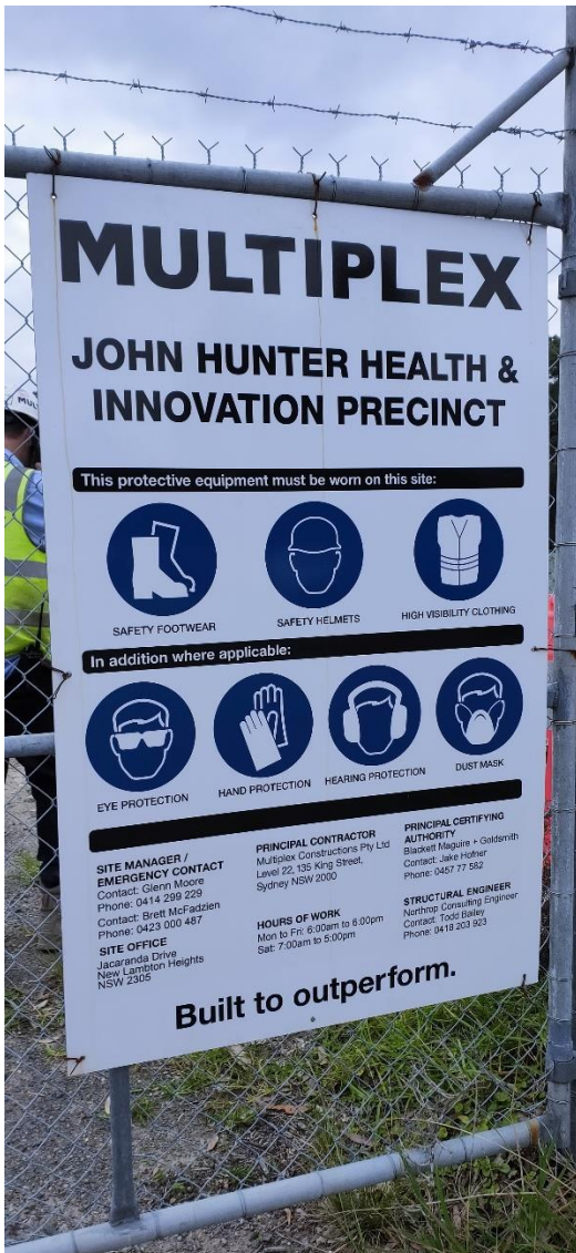
Photograph 2 – Site Signage