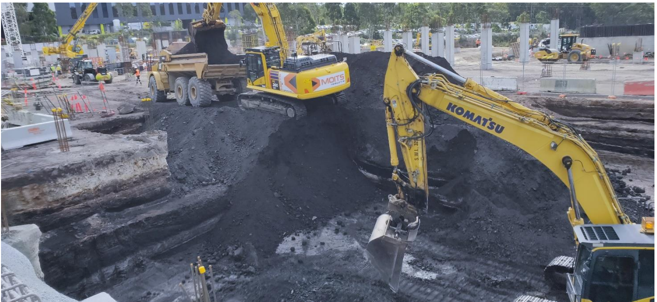
Photograph 8 – Bulk excavation ASB looking north-west