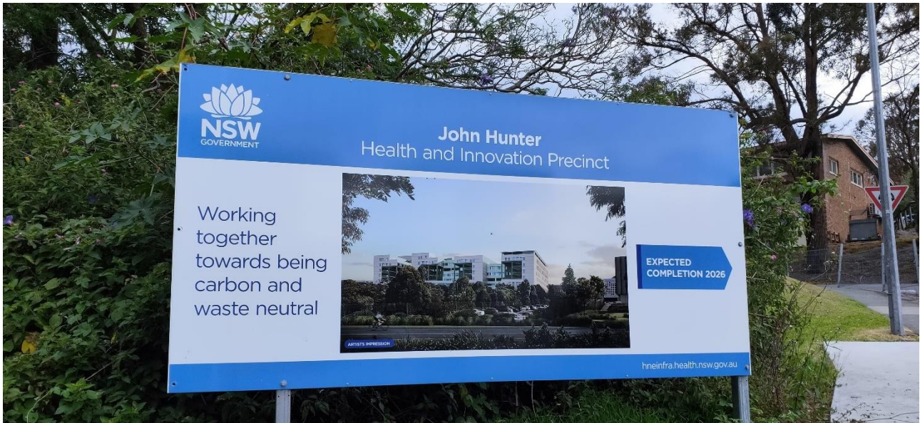
Photograph 1 – Project Signage