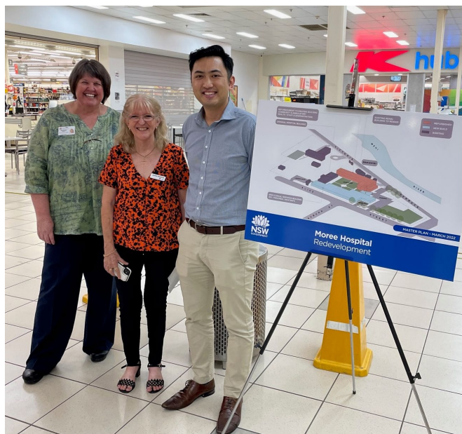
Images: the project team engaging with community members in Moree in April 2022.