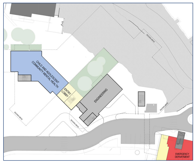
Level 1 of the new building, showing the child and adolescent community and mental health wing.

The NSW Government announced in June 2022 an additional $14.6 million for the project to include facilities for adolescents and young people.