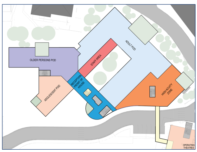
Level 2, showing the inpatient areas for adolescents, adults and older persons, as well as the high acuity zone, with a link to the Emergency Department.