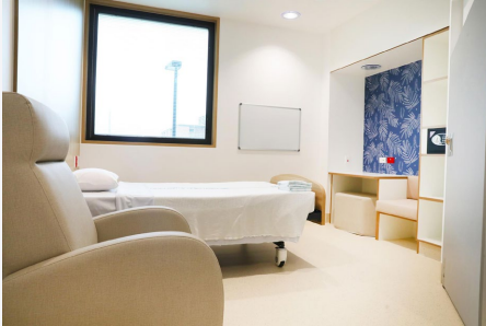
An example of artwork installed in a patient bedroom in the new Blacktown Mental Health Recovery Centre, Western Sydney LHD.

We are seeking interest from local artists with strong connections to Tamworth to provide artworks that will inspire and comfort patients, visitors and staff in clinical spaces of the new mental health unit.