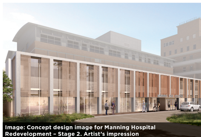
Image: Concept design image for Manning Hospital Redevelopment - Stage 2. Artist's impression

Separating public areas on level 1 from clinical / patient areas on level 2, the spine supports access and way finding around the hospital for community, improves core clinical relationships and ensures the comfort and dignity of patients.